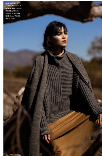
ALL SHIRTS: SUEI ALFRED: JACQUELINE A DOLCE & GABBANA: A BANDIERA: A DOLCE & GABBANA: A DOLCE & GABBANA: A DOLCE & GABBANA: A DOLCE & GABBANA: A DOLCE & GABBANA: A