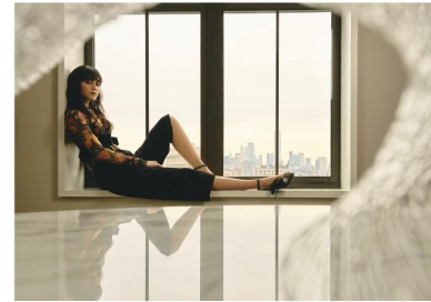
TOP AND PANTS BY DOLCE & GABBANA BELT BY AIGONIA SHOES BY LENA ERZIAK

height 5'9.5" bust 32" a waist 24" hips 37" dress 4 us shoe 9.5 us hair brown eyes brown