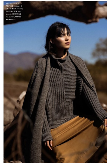
ALL SHIRTS SHIRT MIXED MATERIAL A BY RICHIE BARKER BY SEZANNE BARKER RICHIE